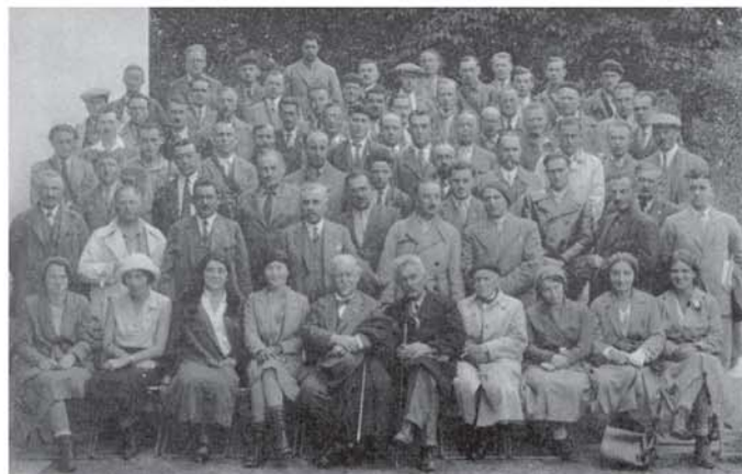
Participants of the 3rd Congress in Czechoslovakia 1931.

The first congress CGA was held in Lvov (then in Poland) in 1925, the second in Bucharest in 1927 and third in Prague in 1931. The successful work of the Association was cancelled before the Second World War.